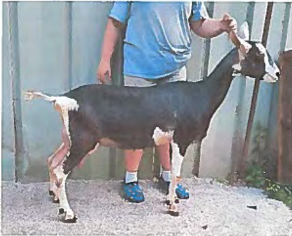
Maternal sister: Klisse's KJ Angelonia 2*M