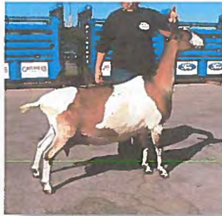
Paternal sister: SG Klisse's NSNN Cascara Berry 1*M