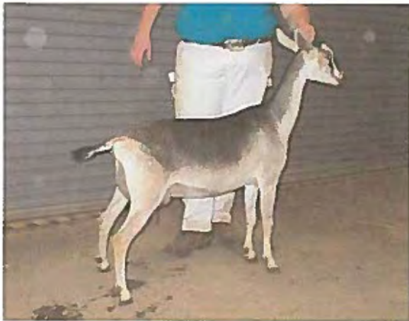
Maternal granddam: Klisse's KAOH Lotus