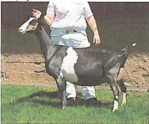
Paternal sister: SGCH Klisse's NSNN Leah 4*M 1 st /1 st udder yearling milker '11 Nationals LA: 6-01 EEEE 92