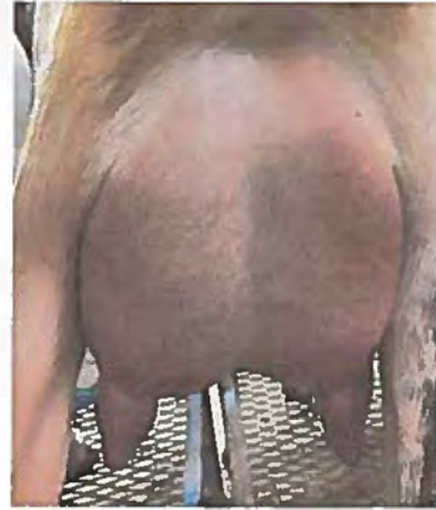
Maternal sister's rear (yearling)