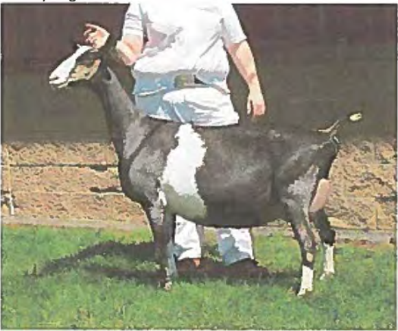
Paternal sister: SGCH Klisse's NSNN Leah 4*M 1 st /1 st udder yearling milker '11 Nationals LA: 6-01 EEEE 92