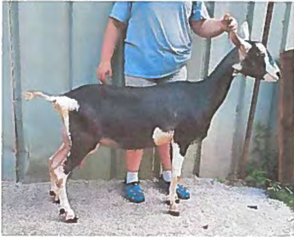
Maternal sister: Klisse's KJ Angelonia 2*M