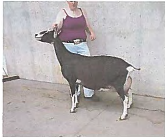
Paternal sister: SGCH Gotta Lovem Baby Doe 1*M 1 st /1 st udder Aged doe 2018 Nationals