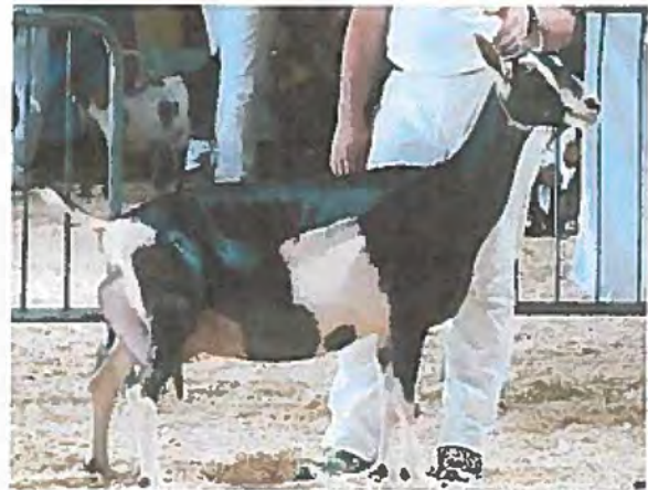
Paternal sister: SGCH Klisse's NSNN Carillon of Hope 7*M National Champion/Best Udder Nationals 2012