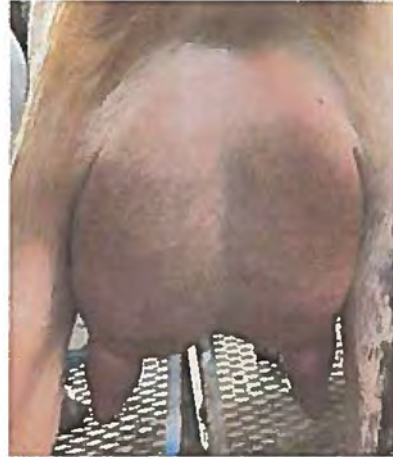
Maternal sister's rear (yearling)