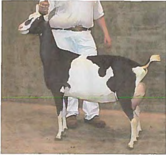
Dam: SGCH (pend.) Klisse's SSCS Begonia 1*M