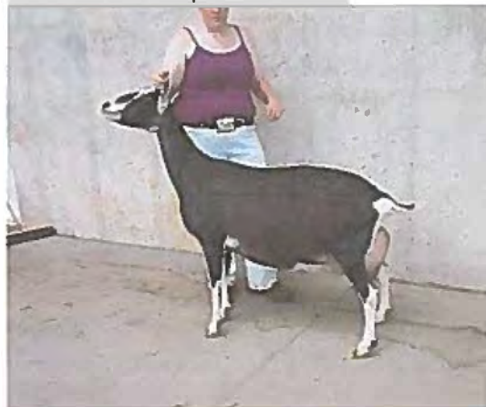
Paternal sister: SGCH Gotta Lovem Baby Doe 1*M 1 st /1 st udder Aged doe 2018 Nationals