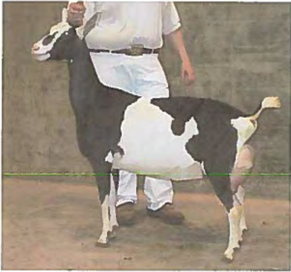
Dam: SGCH (pend.) Klisse's SSCS Begonia 1*M