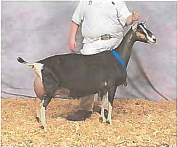
Paternal sister: SGCH Klisse's NSNN ChocolateCrinkle 10*M National Champion/Best Udder 2016 Nationals 2011 Spotlight doe LA: 7-05 EEEE 91