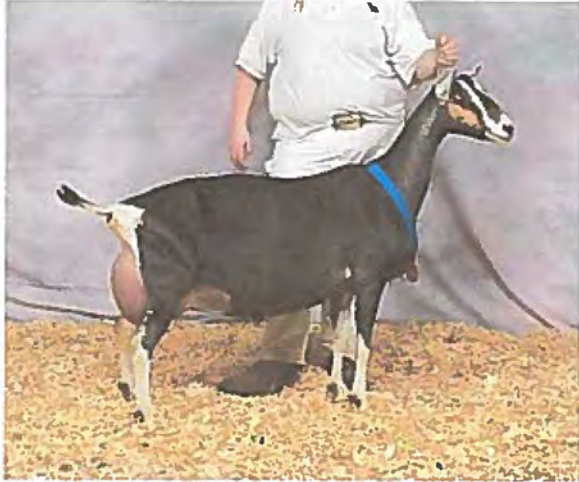
Paternal sister: SGCH Klisse's NSNN ChocolateCrinkle 10*M National Champion/Best Udder 2016 Nationals 2011 Spotlight doe LA: 7-05 EEEE 91