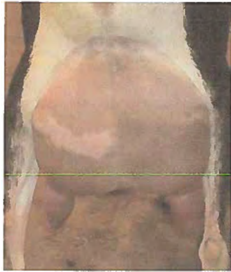
Dam's rear (2 nd freshener in these pics)