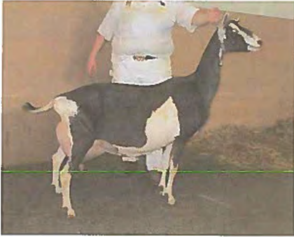
Paterna sister: SGCH Klisse's NSNN Catastrophe of Hope 6*M Reserve Udder Nationals 2013 LA: 5-05 EEEE 90