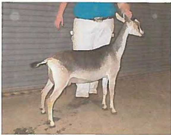
Maternal granddam: Klisse's KAOH Lotus