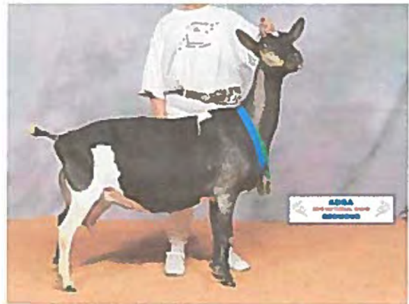
Paternal sister: SGCH Klisse's NSNN Valor of Hope 7*M Reserve National Champion 2019 Nationals