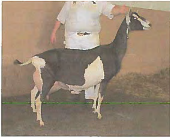
Paternal sister: SGCH Klisse's NSNN Catastrophe of Hope 6*M Reserve Udder Nationals 2013 LA: 5-05 EEEE 90