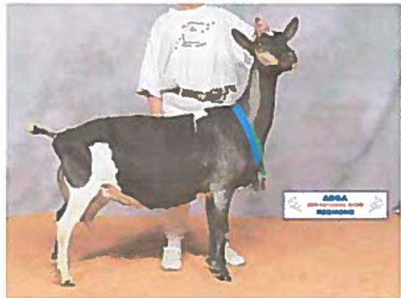
Paternal sister: SGCH Klisse's NSNN Valor of Hope 7*M Reserve National Champion 2019 Nationals