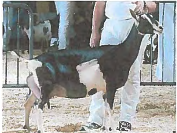
Paternal sister: SGCH Klisse's NSNN Carillon of Hope 7*M National Champion/Best Udder Nationals 2012