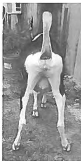
Nominee: Klisse's NSNN Periwinkle DNA Verified