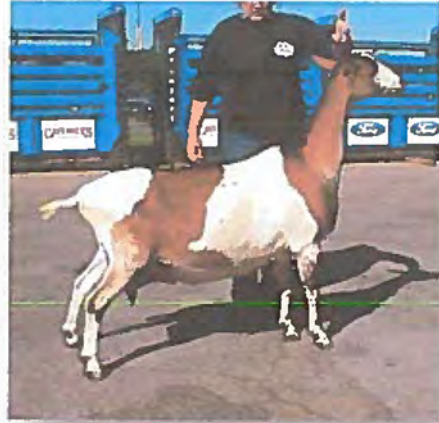
Paternal sister: SG Klisse's NSNN Cascara Berry 1*M